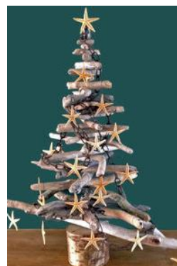
Wooden sticks and stars