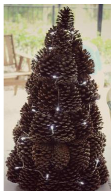
Pine cones & battery lights