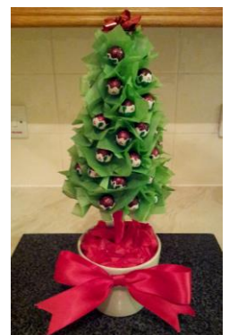
Tissue paper & ribbon